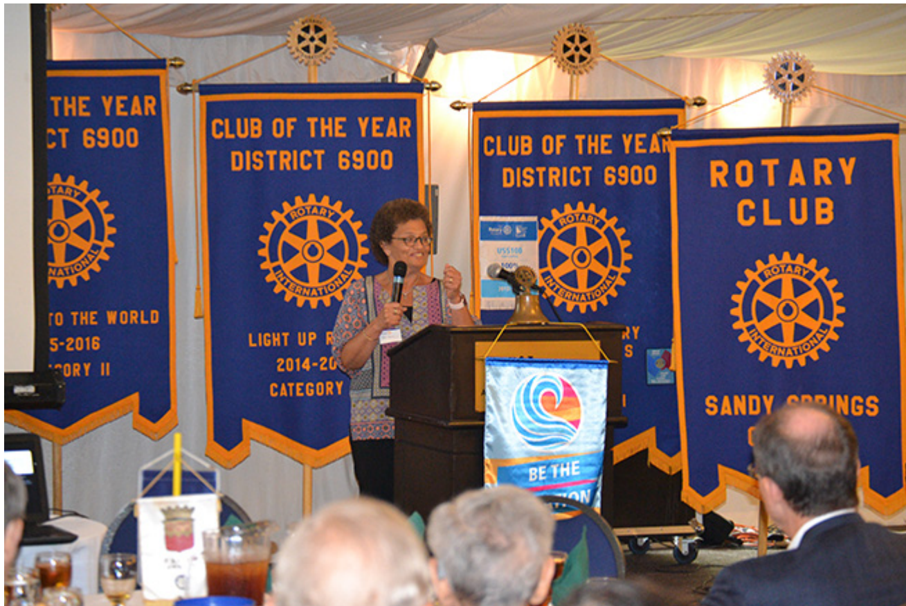
Below are photos from the meeting.