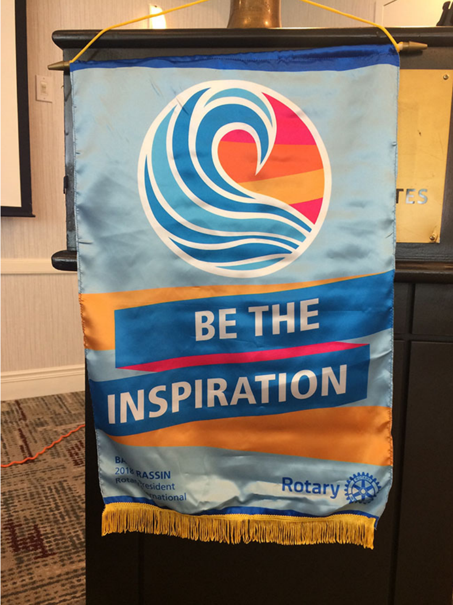
Millenials Don't Polish Silver