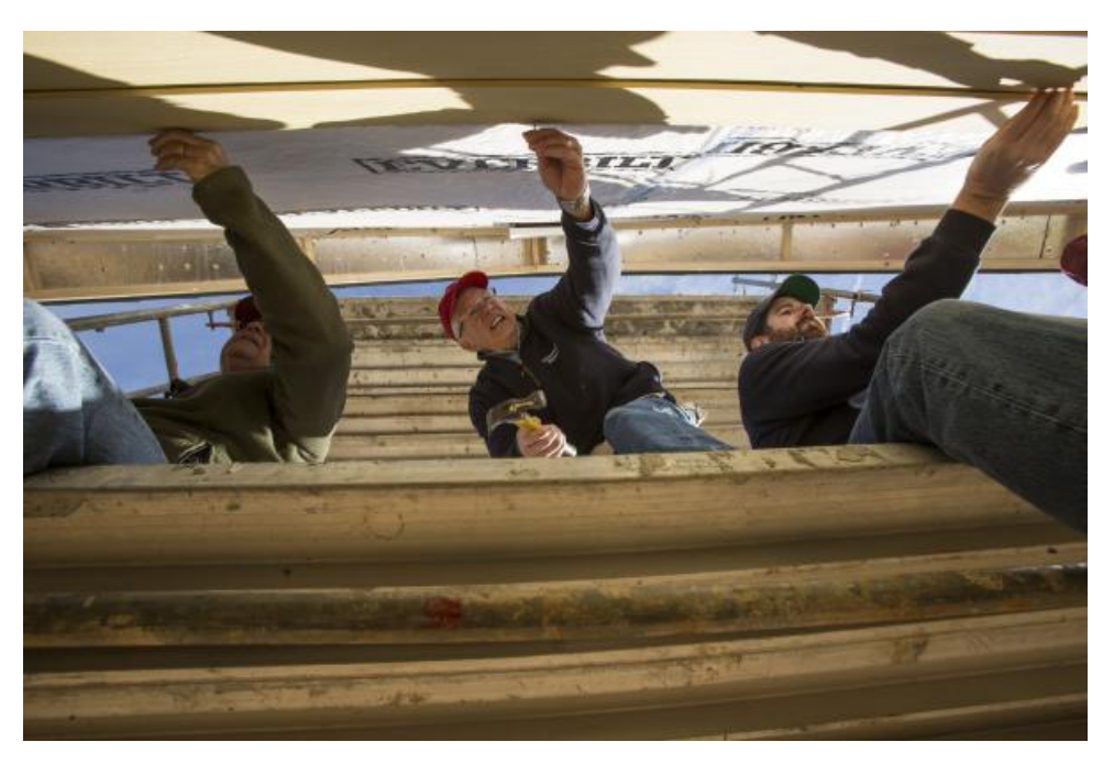
Habitat for Humanity, one of Rotary's newest service partners, builds homes for