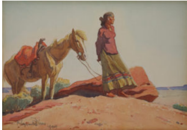
Image: © Maynard Dixon, Navajo Woman , 1944, watercolor, 7 x 10", Mark Sublette Medicine Man Gallery & Maynard Dixon Museum Tucson