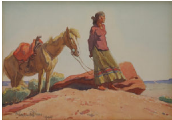
Image: © Maynard Dixon, Navajo Woman , 1944, watercolor, 7 x 10", Mark Sublette Medicine Man Gallery & Maynard Dixon Museum Tucson