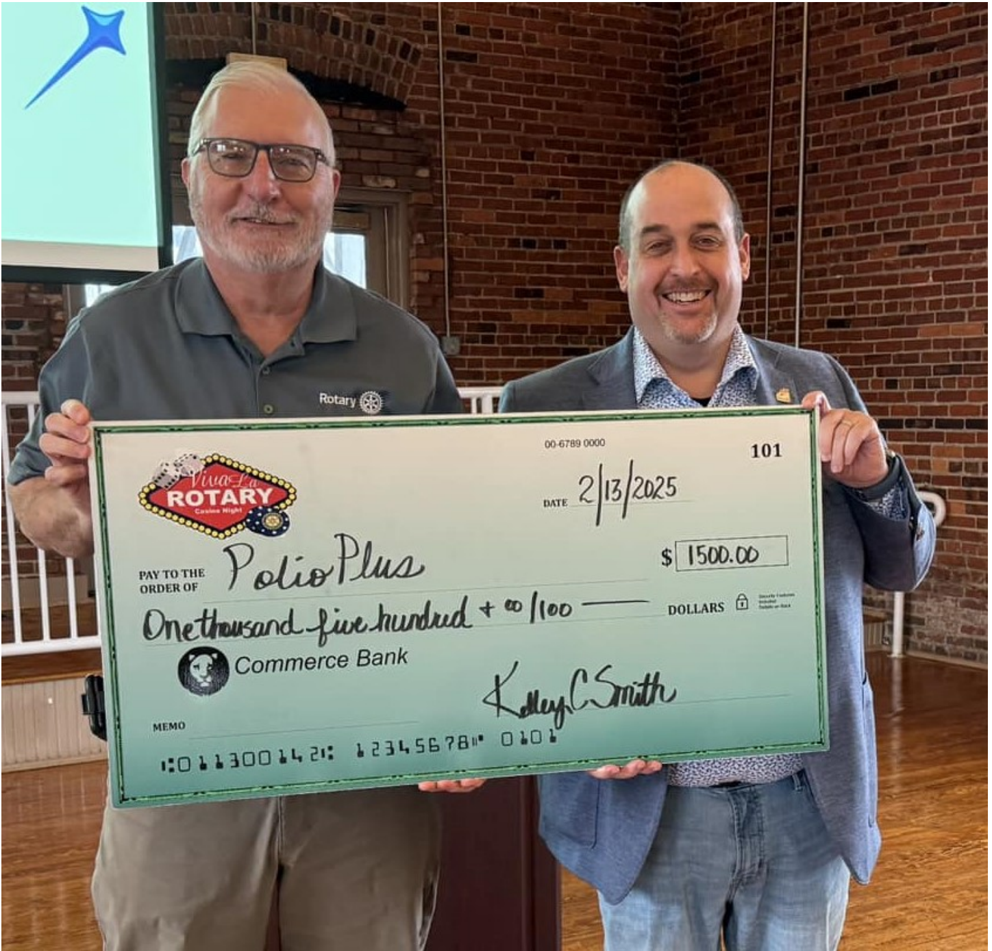
The Camilla Rotary Club recently donated $1,500 to the End Polio Now campaign. With the Gates Foundation 2 to 1 match, this donation will provide 7,500 doses of polio vaccine. And that's not all - last Saturday night, the club hosted a Casino night, with proceeds to support the Mitchell-Baker Service Center, a day program that serves over 95 adults with developmental disabilities.