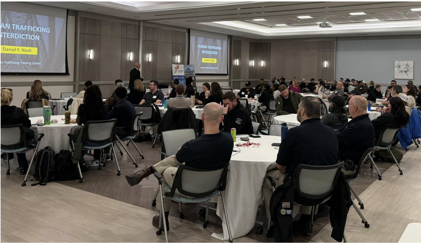
Posted by Mandy Timmons March 2, 2025